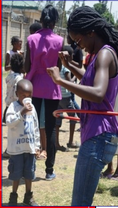
Maths Student entertains a resident of the home