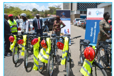
Shiny bikes waiting for the launch