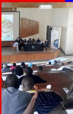
PACN Plenary session at the Millennium Nall

This year's Pan Africa Chemistry Network Congress took place at the University of Nairobi, Chiromo Campus Kenya from 30th November to 2nd December 2016.