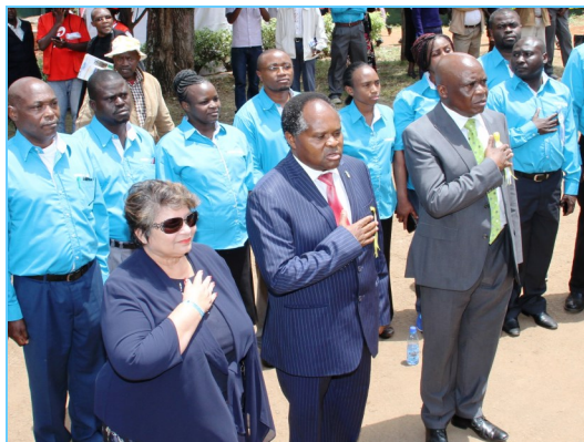
UON Chancellor, Vice Chancellor and Show Chairman Respect the National Anthem

Developed by the Department of Physics, this is a locally designed and fabricated aerial system that is utilized to spray pesticides in farms. It is automated, easy to deploy and follows specified instructions. Other applications of this system are: crop monitoring, land mapping, crop disease detection and crops classification. The device, uses Global Positioning System (GPS) coordinates, to fly on its own to selected farms and perform the various functions.