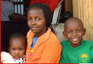
Children from the Grace Children's home outreach destination of the Chiromo Christian Fellowship