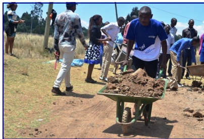
MANU Members hard at work