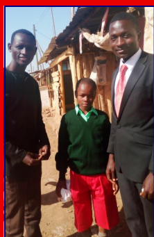
Peer Mentors present school uniform to the best performer in Kabiro Primary, Kawangware, Nairobi

University of Nairobi Peer Mentors Club (UoNPMC), Nairobi University Computer Science Students Association (NUCOMSSA), Chiromo Campus Christian Staff Fellowship (CCCSF) and Mathematics Association of Nairobi University (MANU) took on an initiative role to reach out to one of the most vulnerable groups in the society, children.