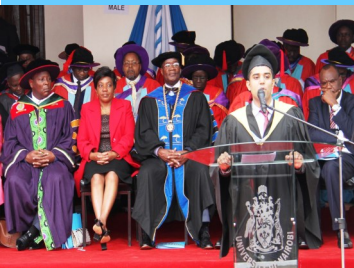
From Pg 1