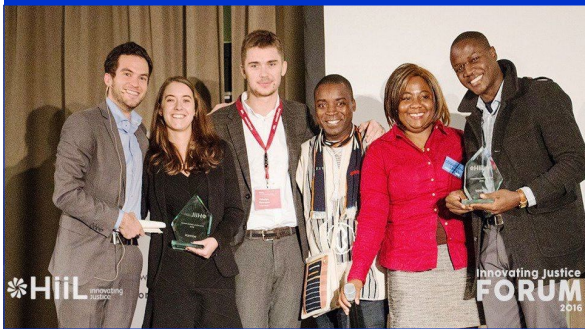
Award winners pose in a group snapshot

accelerator program that runs the Justice Innovation Challenges.