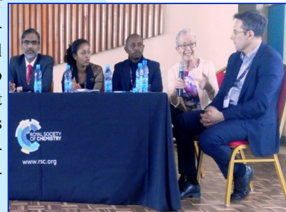
A section of the panel addressing the plenary