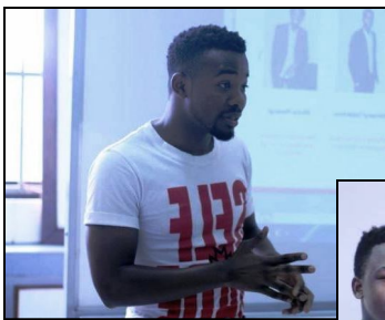
AJTIA INNOVATIVE START-UP'S GRADUATE