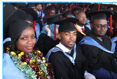
A section of the graduates