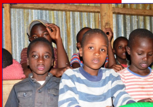
Children from Grace Community Children's home