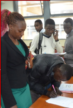
CBPS staff assist students go through registration