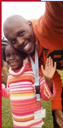
NUCOMSSA Member with a resident of the home.