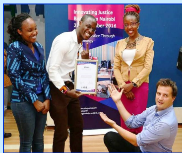
Famalia App developer enjoy a light moment at HiiL 2016 at the Africa Regional pitch

The mobile app, known as Famalia was awarded 20,000 EUR as the overall winner of The Hague